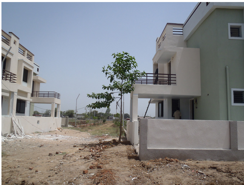
FIGURE 2.1. Sprawling outskirts of Anand, with newly constructed houses, plots waiting for development, and mostly unpaved roads.

which residents of the wider Anand district travel to visit offices and attend court. Its growth has been gradual but significant. In the 1950s, Anand was still the size of a village, with a population of 25,767 residents (Thakar 1954). By 1962, the town had grown to an estimated 40,000 residents. Thereafter, according to census data, the population kept growing gradually, to 83,936 in 1981 and to 198,282 in 2011. As the town grew, it turned into a sprawling urban conglomerate that now includes several adjoining villages and various newly developed residential and commercial areas. This “Urban Agglomerate Anand,” as it is referred to in the census, had a population of 288,095 in 2011. (For an overview of the town’s growth since 1991, see table A.06).