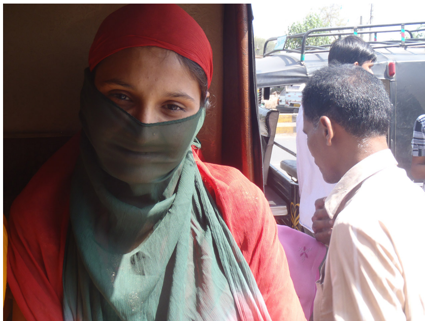
FIGURE 4.1. Resident of Anand traveling to the nearby town of Petlad in a shared autorickshaw, face covered with a dupatta to protect against dust on the road.

THESE SCENES FROM a day of travel-along research demonstrate that urbanization and residential segregation have not erased the possibilities of maintaining economic and social links with people and places in the wider region of Charotar. For landed business families like these, members of an urbanized Muslim community in Anand, their occupations remain closely tied up with the surrounding region, and with various social networks. Their investments also symbolically reaffirm a link to the land itself, so that the everyday rural-urban exchanges of the landed business families can also be regarded as a concrete substantiation of Vohras belonging to the Charotar region.