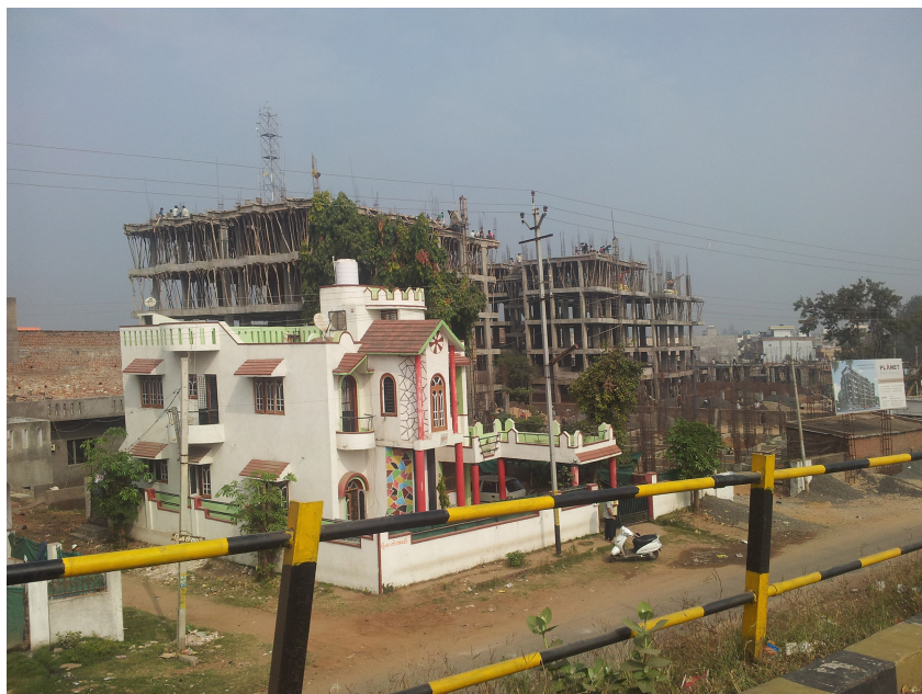
FIGURE P.1. View from the overpass, Anand.

(which, I learned later, are the temporary homes of temporary laborers—both Hindu and Muslim—working in Anand’s thriving construction industry).